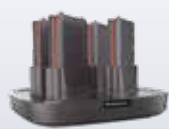
94ACC0192 4-slot Battery Charging Dock