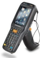
Mobile Handheld Computer